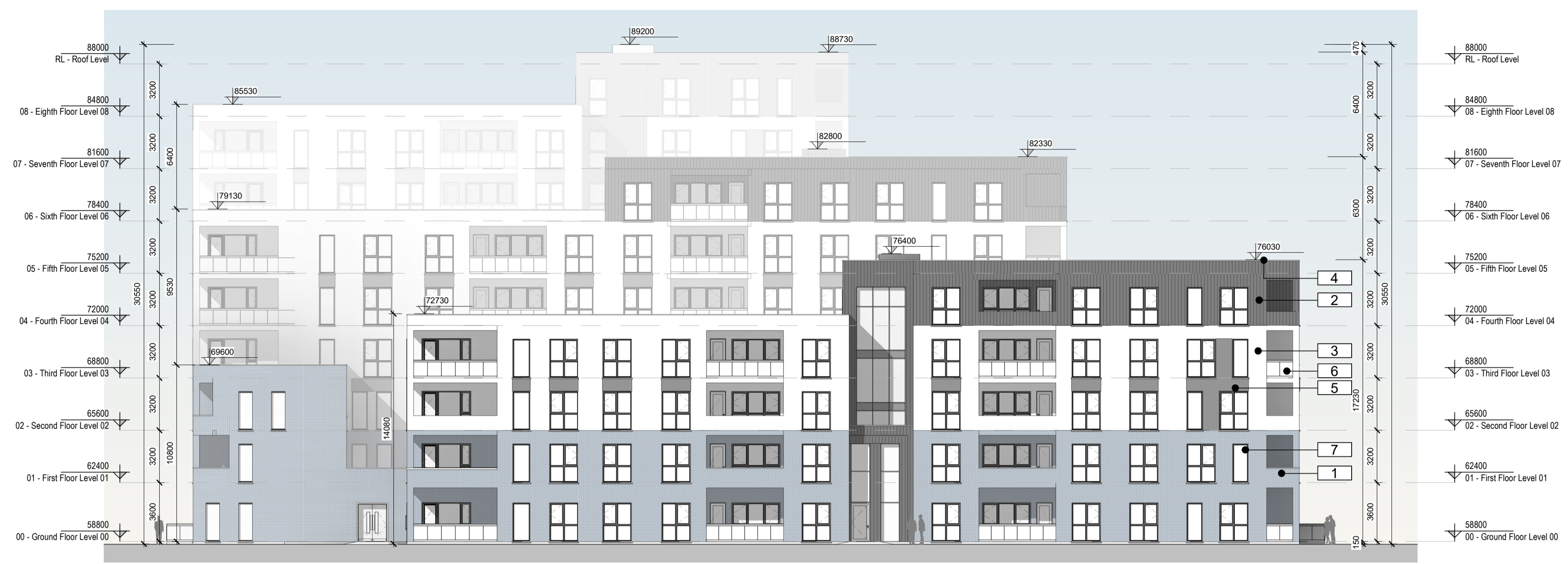
1 WEST ELEVATION