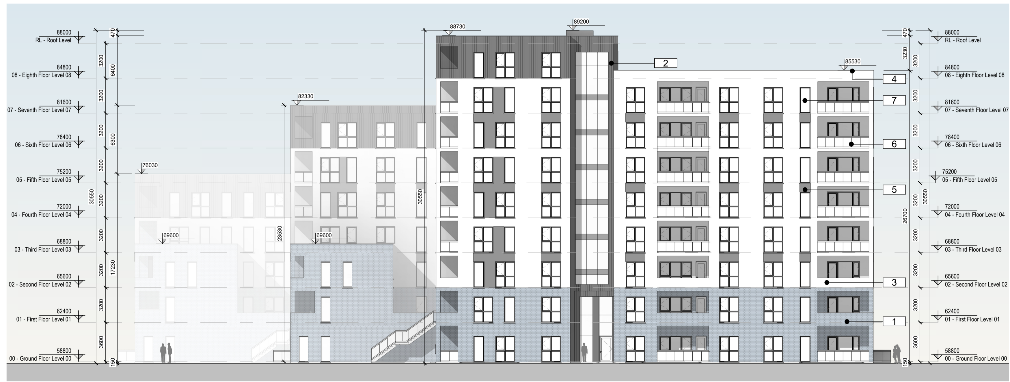
2 EAST ELEVATION